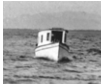
The original "Kaleden"