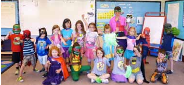
Kindergarten students celebrate completion of the FUN FRIENDS program by dressing up as their favourite hero.

Things are winding down for the year here at Kaleden Elementary School. Great News! "Kaleden After School Care" is a go for the next school year! Please pick up your registration form at the school office. Now is the time of year when we reflect on the achievements and successes that all students have made academically, socially and emotionally. One particular thing to celebrate is the Kindergarten graduation from the FUN FRIENDS Program. The FUN FRIENDS Program is co-funded through the Ministry of Education and the Ministry of Children and Families. This program teaches our youngest students important coping and resiliency skills. Some of these skills include learning how to be brave, cope with challenges, identify and express feelings in pro-social ways, think in positive ways and identify support people in their lives.