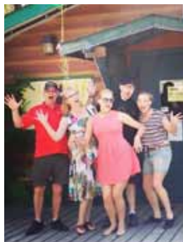
The Hoy Family in 2015