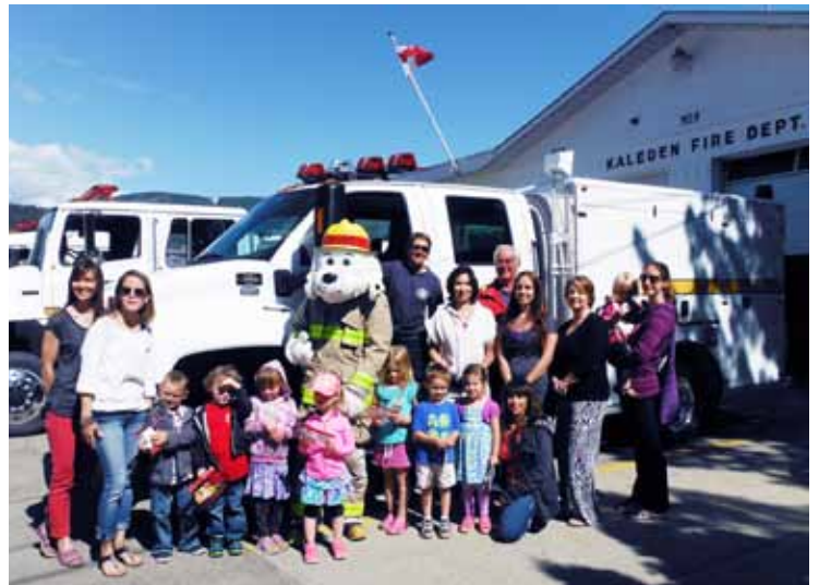
The Kaleden Preschool Class visited the fire hall for a tour. They learned lots about being fire safe and remind everyone to be careful around campfires this summer.

To report a wildfire call: 1-800-663-5555 or *5555 Visit BCWildfire.ca for updated information.