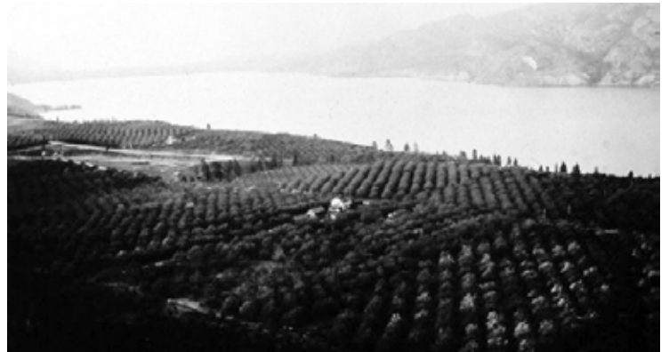
The fruit tree orchards of Kaleden in 1918.